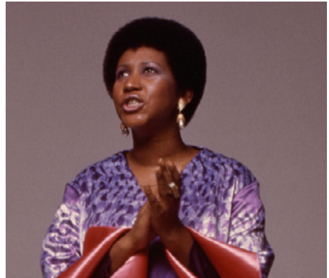
Singer, Aretha Franklin