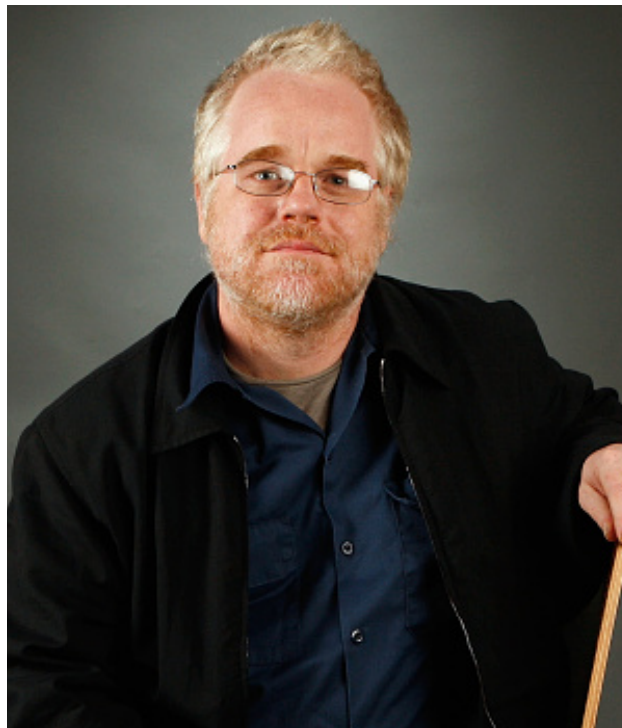
Actor, Philip Seymour Hoffman

at death is free of estate taxes. Hoffman's estate ended up owing close to $14 million in estate taxes.