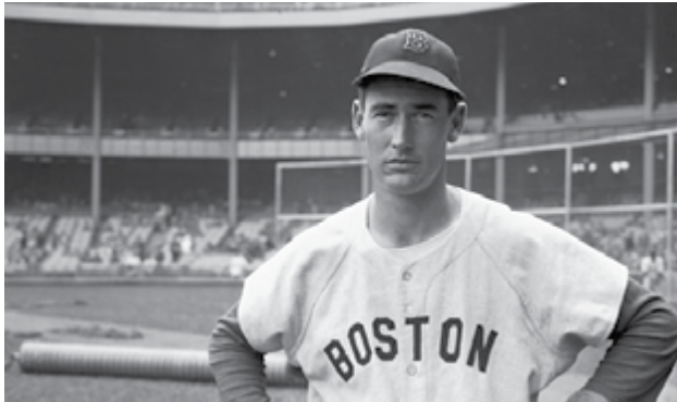
Athlete, Ted Williams