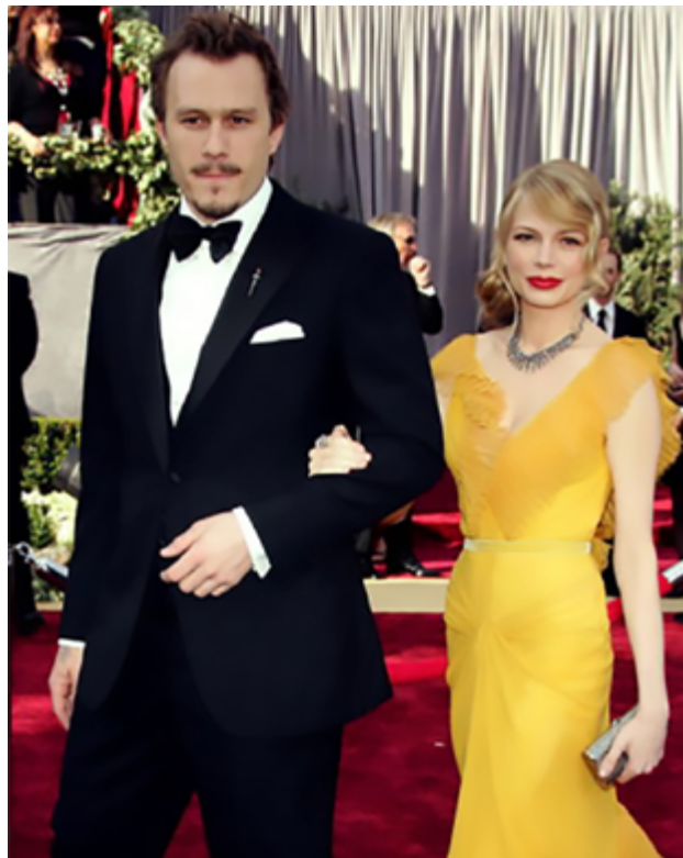
Actor, Heath Ledger

According to his will, half of his estate would be split between his sisters, and the other half would go to his parents. Fortunately for Matilda, her aunts and grandparents gifted her father’s estate to her.