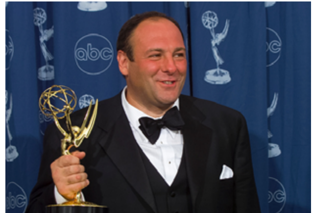
Actor, James Gandolfini