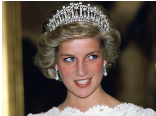
Princess of Wales, Diana

Letters not written by a lawyer often fail to be honored when it comes to estate planning. If Diana's Letter of Wishes was included directly in her will, then the lawyer who prepared it could have ensured her wishes were followed.